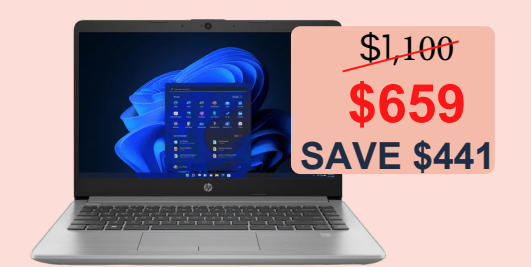
HP 240 G9 N4500 14" Intel Celeron + Win 11 Pro 8GB RAM / 256 GB Storage

HP Chromebook 11MK G9 11.6" Touchscreen MediaTek Processor, ChromeOS 64 8GB RAM / 64 GB Storage