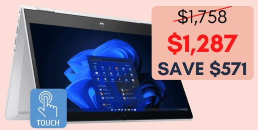
HP ProBook x360 435 G9 13.3" AMD R3 + Pen + Win 11 Pro 8GB RAM / 256 GB Storage