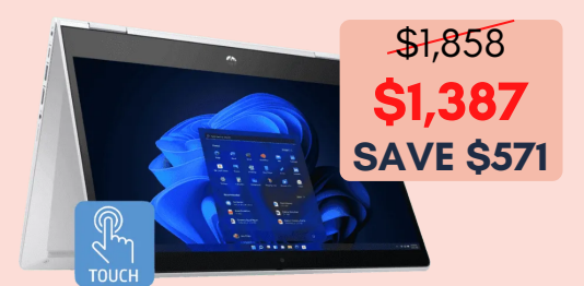
HP ProBook x360 435 G9 13.3" AMD R5 + Pen + Win 11 Pro 8GB RAM / 256 GB Storage