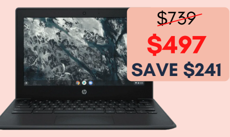
HP Chromebook 11MK G9 11.6" MediaTek Processor, ChromeOS 64 4GB RAM / 32 GB Storage

Optional 3yr Accidental Damage Protection Insurance from ONLY $97 inc GST for ProBooks & $125 inc GST for Chromebooks - NOTE: this is purchased separately to the hardware after the 4 day wait period.